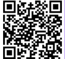
BINGO LANDING PAGE