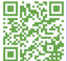
RIVERA TENNIS ACADEMY