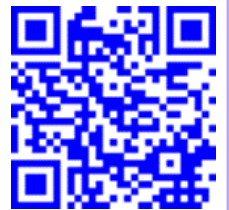
FOST TEAM WEBSITE