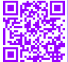
EASTER EVENT LANDING PAGE